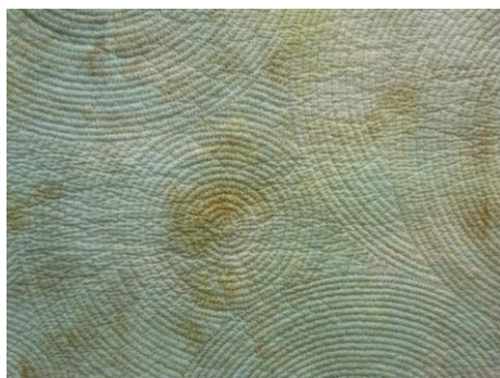
Detail image of artwork

The circular hand quilted textural design is continued in this textile artwork. It adds physical and visual texture to the artwork. These interconnecting elements make these pieces work very well together for large installation possibilities. Once again, this artwork is designed to be displayed vertically or horizontally.